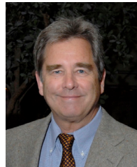
Beau Bridges Award-winning actor