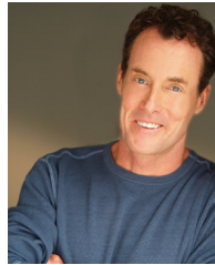
John C. McGinley Award-winning actor