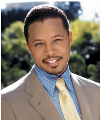
Terrence Howard Award-winning actor

Expect a STAR-STUDED fashion show with celebrities and beautiful models with Down syndrome