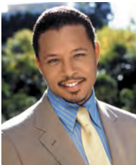
Terrence Howard Award-winning actor

Expect a STAR-STUDDER fashion show with celebrities and beautiful models with Down syndrome