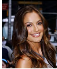
Minka Kelly Acclaimed actress