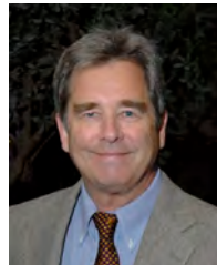
Beau Bridges Award-winning actor