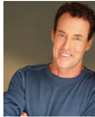
John C. McGinley Award-winning actor